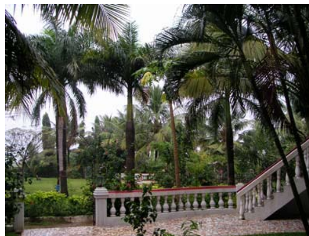
Gardens at the Ideal River View hotel

We are publicising this trip as early as possible to give you time to think about coming and also to assemble the funds. We will be taking deposits for the trip. The initial