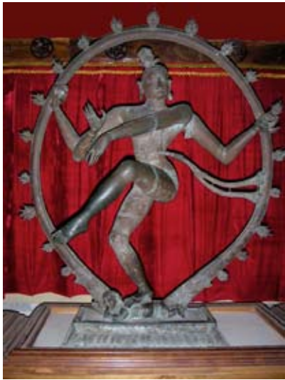
Left - one of the old Chola Bronzes on display at the museum in Tanjore - about 3 feet tall!