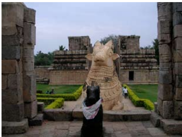
Gangaikondacholapuram temple from the chola dynasty - a world heritage site

The 21 night tour has been arranged with South Indian Panorama, an Indian company whose arrangements have already been tried and recommended to us by reliable sources. All the hotels are of excellent quality and we will be well looked after by our experienced tour driver.