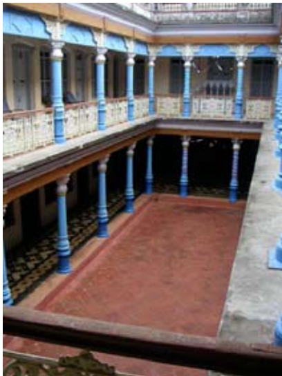
Above - The Chettinad Mansion, built around five courtyards. All rooms at the mansion open onto this courtyard. Meals are served in a well appointed dining room, and a bullock cart is available to take you to the swimming pool.